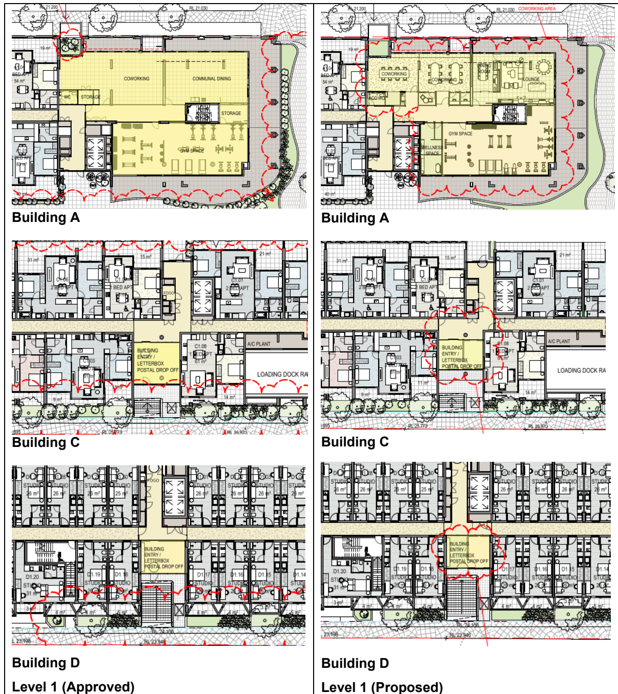
Figure 2 – Comparison drawings Level 1.