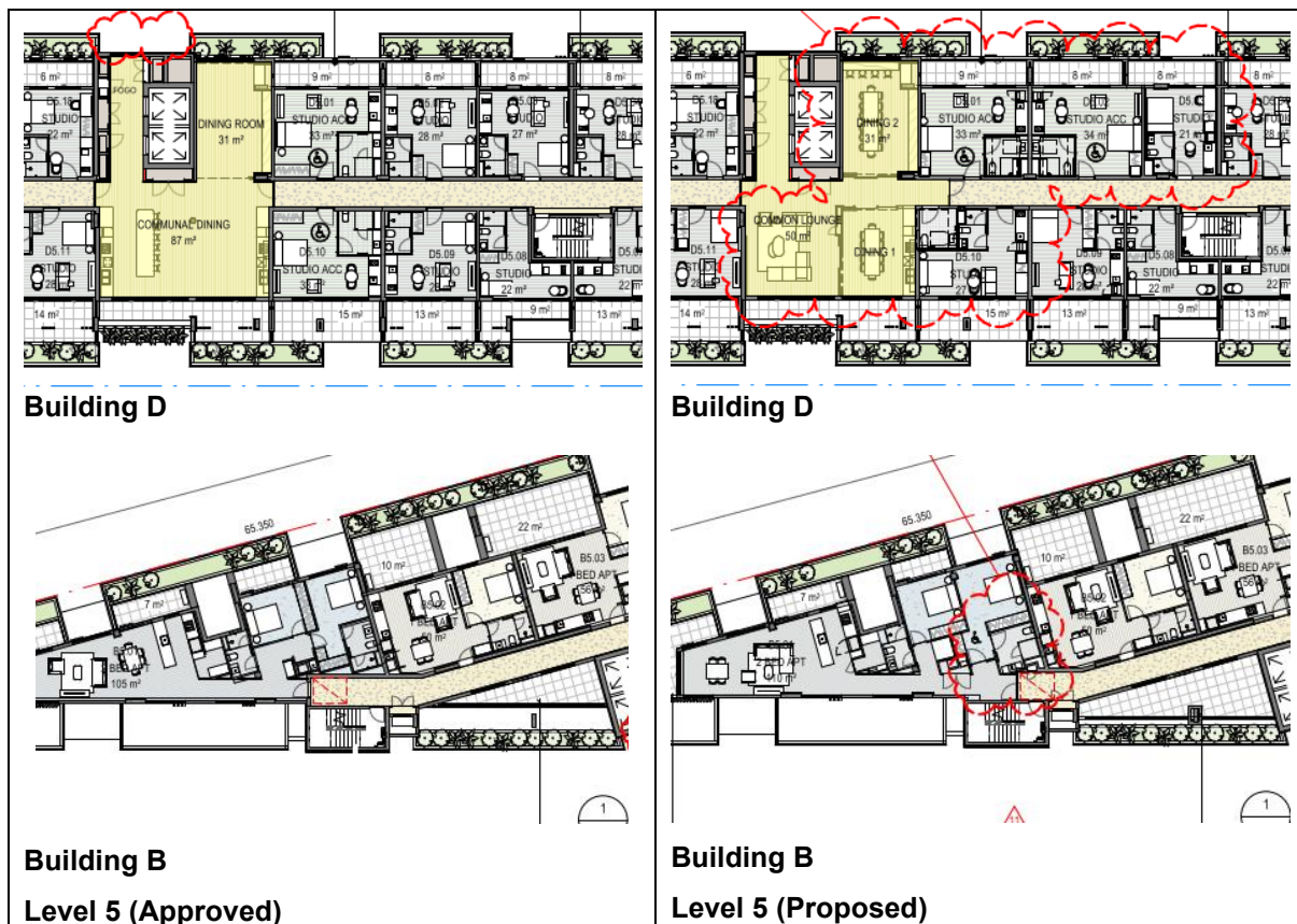
Figure 4 – Comparison drawings Level 5.